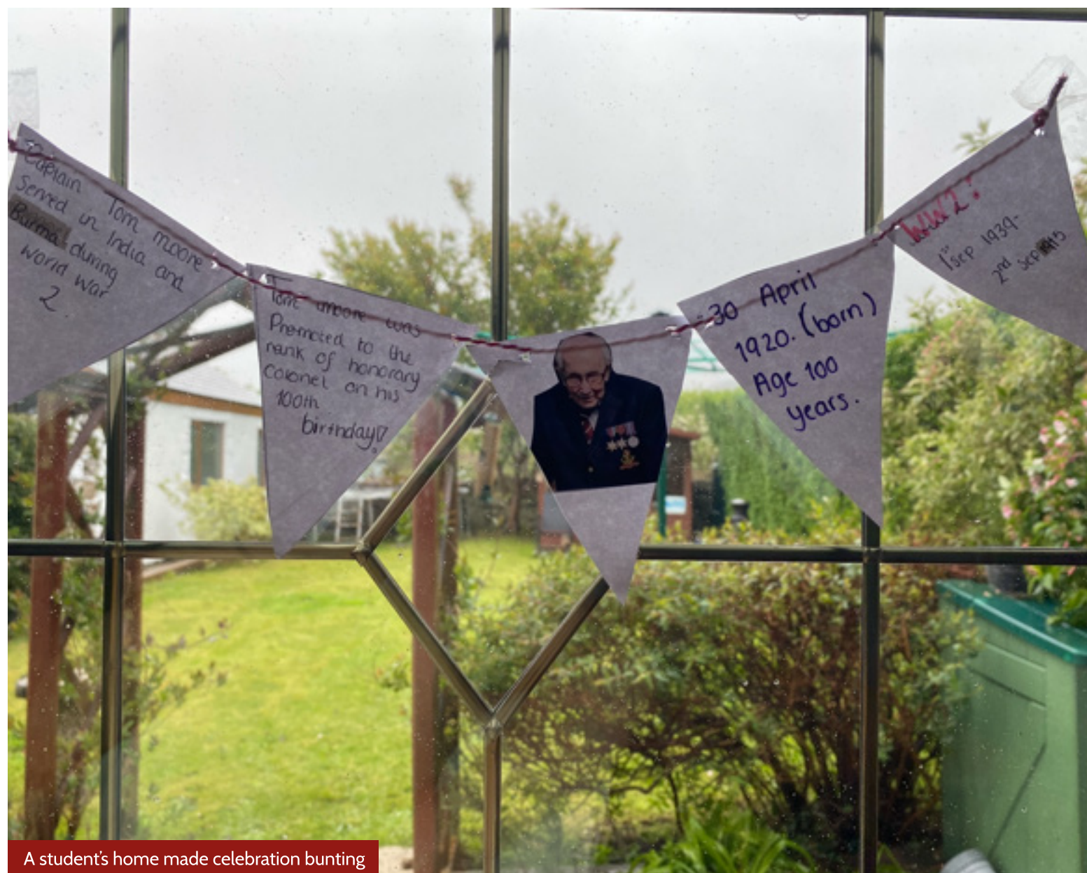
A student's home made celebration bunting