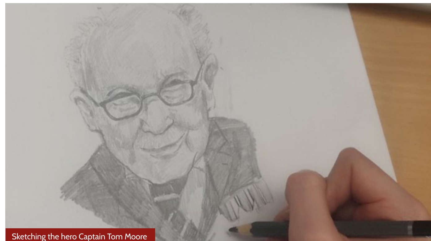
Sketching the hero Captain Tom Moore

"We were very proud of our students thoroughly embracing our VE Day commemorations. They conducted the occasion with the reverence that it deserved whilst celebrating the people